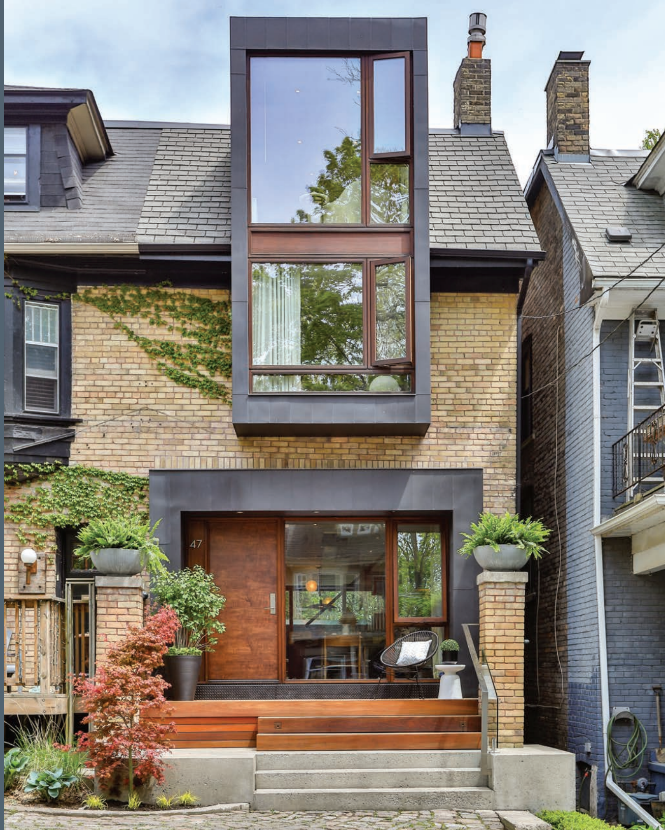
47 FERNWOOD PARK AVE TORONTO